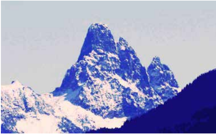
Mount Slesse, 2009. The plane debris and human remains were left in place, as the site was too dangerous to access. Over the years, however, they've gradually slid downhill.

On December 9, 1956, Trans Canada Airlines (TCA) Flight 810 left Vancouver for Calgary. An emergency arose and the plane turned back toward Vancouver. Unfortunately visibility was poor and it smashed into a rocky peak of Mount Slesse (southeast of Chilliwack). All 62 aboard died. At the time this was the worst air disaster in Canadian history. Among the dead were five well-known football players heading home from the CFL All-Star game in Vancouver. The tragedy had two links to North Vancouver: