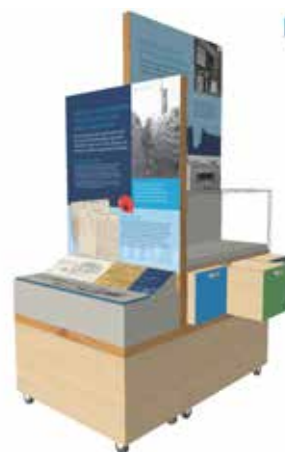
Illustration of proposed mobile exhibits designed for use in various community locations. Design and rendering by KEI Space.

It is said, "No place really becomes a community until it is wrapped in human memory: family stories, tribal