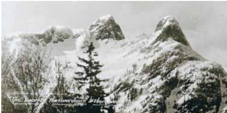
"The Lions: Guardians of Vancouver," photo ca. 1916.

Twin peaks of the Coast Range guard the entrance to Burrard Inlet. Known as "The Lions", the mountains were called Sch'ich'iyúy (or "twin sisters") by the Coast Salish people who have lived in this region for thousands of years. A legend told by Squamish Chief Joe Capilano to E. Pauline Johnson, the famous Mohawk poet, says the sisters were daughters of a Squamish chief. By marrying twin Haida brothers, they brought peace between their warring peoples. After they passed away, the two sisters were immortalized and lifted up to the mountains where they could forever keep watch over their descendants and ensure the peace was kept.