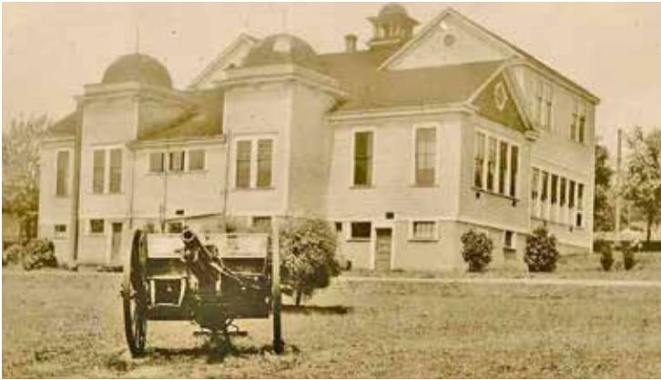
Rear of City Hall, 1922. The Police Department was located at the far-left in 1916-1918.

"A Century Ago" is the first of several planned Express stories about North Vancouver in the years 1916-1918, a time of farms, ranches, wooden sidewalks, lumber mills, shipyards, heroin in drug stores, alcohol prohibition, and World War 1.