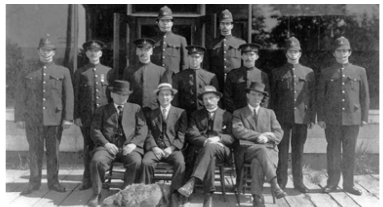
Police officers stand behind seated City officials, June 1915. Shortly after this photo was taken the Department moved into the Central School building.