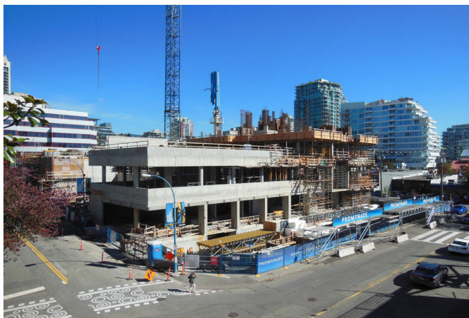
New museum (on second floor) at the corner of Carrie Cates Ct and Rogers Ave, September 2018