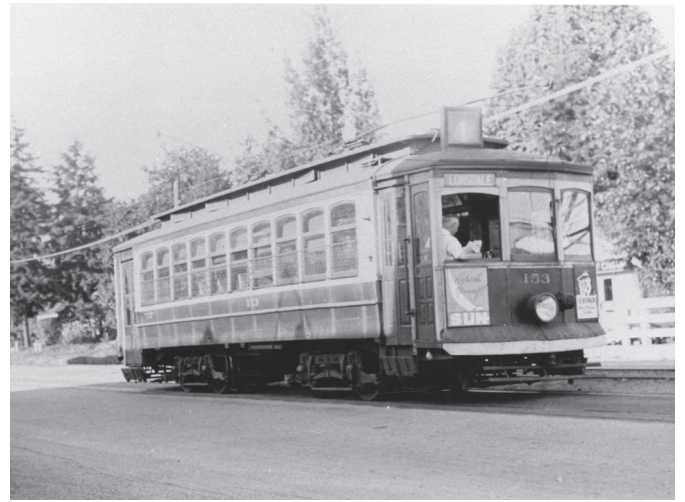
Lonsdale Streetcar no. 153 at passing track at 16th Street. Circa 1943, NVMA no. 6544

Streetcar 153 will soon be “back in service”. This restored street railway car, destined to be a distinctive feature of the museum’s Entrance Pavilion, has a storied history. From 1912-1947 it ran on the Lonsdale line, and after being sold for scrap had a second life as a bunkhouse and then a chicken coop in the Fraser Valley. The car was rescued and moved to Burnaby in 1981, and then purchased by the City of North Vancouver in 1986. During the early 1990s it was partially restored by a team of NVMA volunteers and has been stored, since then, beneath Mahon Park’s grand stand. Full restoration of the car will be completed next year by a team of heritage rail experts and it will be moved into the new museum before the Entrance Pavilion’s windows are installed.