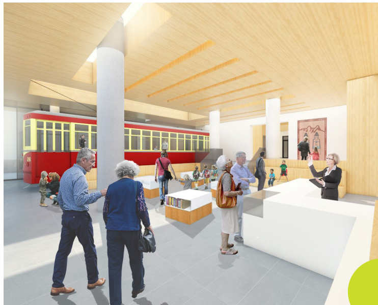
Lonsdale Streetcar no. 153 in the museum Entrance Pavilion, Urban Arts Architecture rendering.

Plans and preparations are well underway for the launch in 2019 of a community fundraising campaign to generate $2.5M to outfit and equip the new museum.