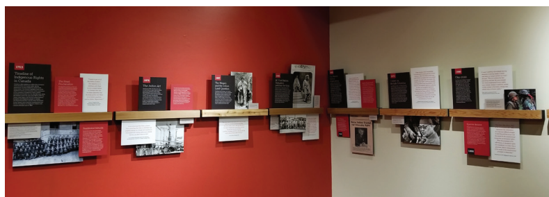
Timeline of First Nations Rights, Alert Bay