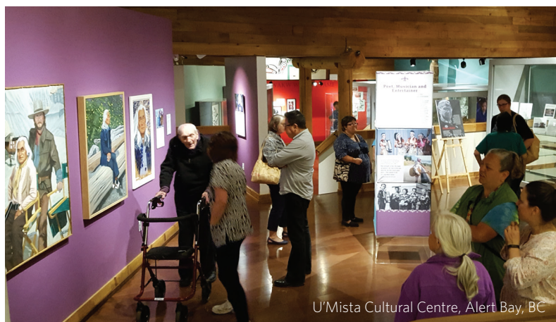
U'Mista Cultural Centre, Alert Bay, BC

THE 2017 HERITAGE ADVOCACY AWARD in recognition of Indigenous Program Collaborations was awarded by the District of North Vancouver to MONOVA and collaborators for the Chief Dan George Exhibit.